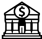
Open Banking & Payments